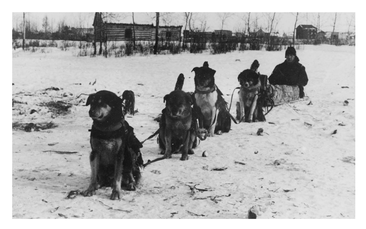
Dog team with decorated standing irons on harness at Prince Albert c. 1900