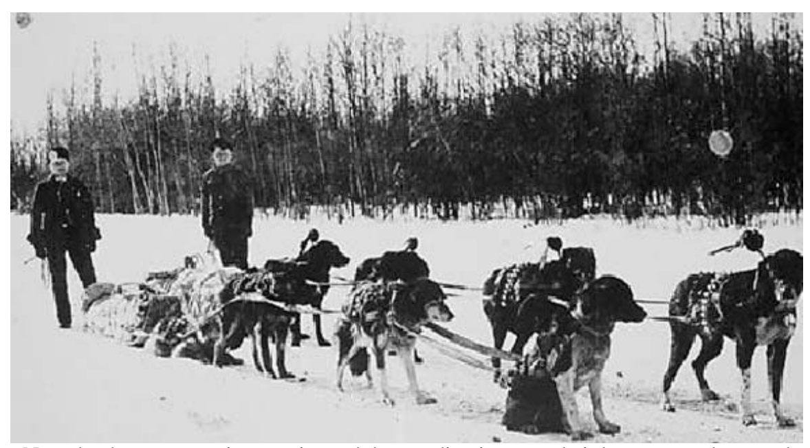
Note the dogs are wearing tuppies and the standing irons on their harness are decorated with pom poms and ribbons.

"Li tapis" or tuppies, as they were commonly known are blankets made out of wool or felt, decorated and used to cover a dog driver's team. These blankets would be decorated with brightly beaded or silk embroidered floral designs, accented with silk ribbons and bells.